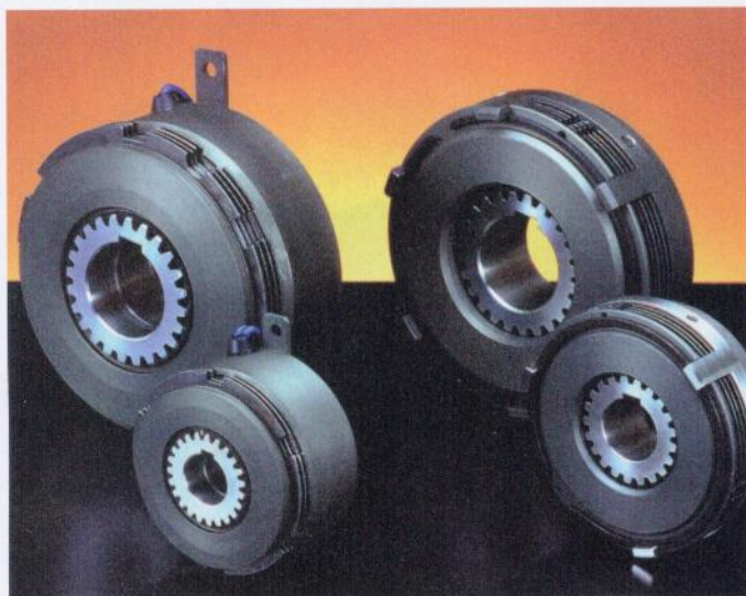
Ogura's MD series of clutches and brakes insures accurate research quality data collection.