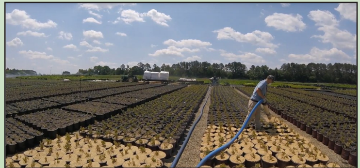
Worker blowing rice hulls at nursery

During the design process, Tom needed a way to regulate both the feeding of the hulls to the airlock and controlling the blower independently. The dispensing requires stopping and starting frequently when operating the machine, and an electric clutch specifically