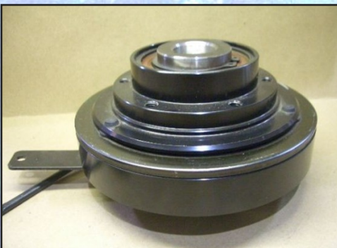
Ogura MA-GT Clutch

runs the auger that breaks up insulation material in the hopper and feeds it down into the shredder (which is powered by the same system) and then down into the airlock where it is blown down several hundred feet of hose into a wall or an attic of the home being insulated.