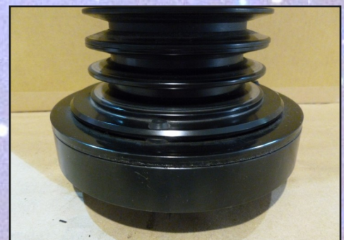
Ogura GT5 Clutch