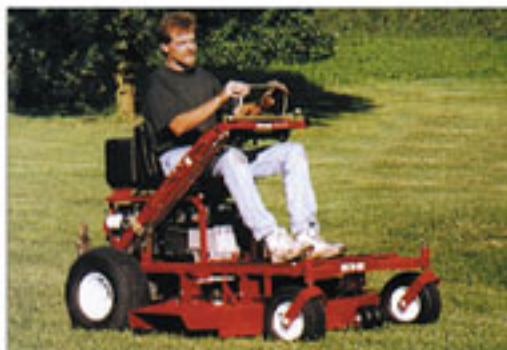
Mower in riding position

Rich Manufacturing Incorporated of Thorntown, Indiana produces an interesting solution to this dual machine need in the form of a "Convertible Mower". Rich's unique design places the operator controls on an arm that can be rotated to the rear of the machine for walk-behind operation, or positioned before the seat to convert the mower to a zero