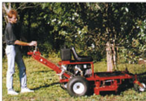
Mower in walk behind position

When power is applied to the clutch, the armature and pulley are magnetically coupled to the rotor and engine power is transmitted through a belt or drive shaft. When the