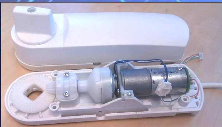
Clutch Gearbox and Motor

The new motor lock is installed in private homes of care-dependent people. This helps the caregivers by providing convenient and safe access to the outpatient care homes at any time, especially in case of a medical emergency.