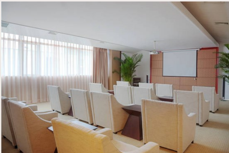
Ogura clutches and brakes help control motorized curtains

C urtains and blinds help our homes create a more comfortable living space. They can be found in most households in one form or another. The basic roles of curtains are to provide privacy, adjust light coming in from a window and temperature insulation. Another role of curtains, which is less of a priority when purchasing them, is crime prevention. At night, curtains prevent would-be thieves from easily determining if anybody is at home and in the daytime, sheer curtains can do the same. In both summer and winter, curtains provide insulation and help to block sunshine. Curtains can also absorb and reduce noise which is why you find thick noise dampening curtains in hotel rooms.