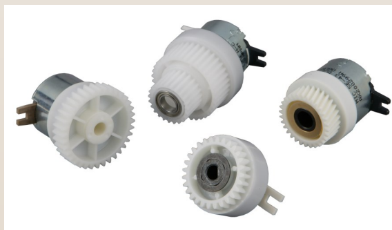
Ogura MIC clutches

curtain could not be opened or closed if a power failure were to occur.