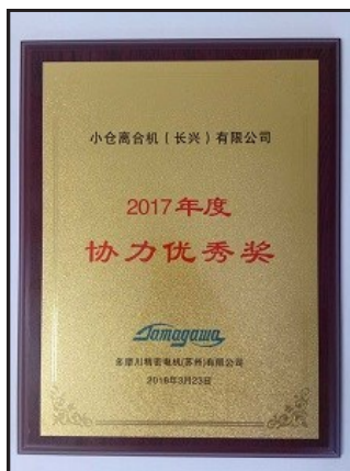
Cooperation Excellence Award

L ast quarter, Ogura Clutch Co. Ltd. China (OCC) received the Excellent Cooperation Award from Tamagawa Precision Machinery Co., Ltd. At the end of 2017, Tamagawa had a large increase in small motor production, which made it very difficult to procure related parts. OCC was recognized as a vendor that provided prompt service and products to help Tamagawa meet this production surge. Additional production increases are projected in the current fiscal year and OCC is increasing production capacity to meet Tamagawa's delivery and quality requirements. ●