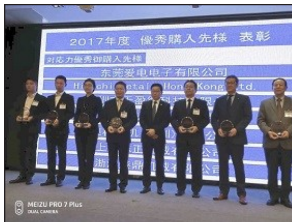
OCW and other suppliers receiving Responsiveness Award

L ast quarter, Ogura Clutch Co. Ltd., China (OCW) received the Excellent Responsiveness Award at the Business Plan & Policy Presentation Meeting held by Matsushita Motors Co., Ltd. OCW was recognized for prompt response to rapid changes in shipment quantities. Their ability for their communication skills and efficient management of the vendor managed inventory was also praised. ●