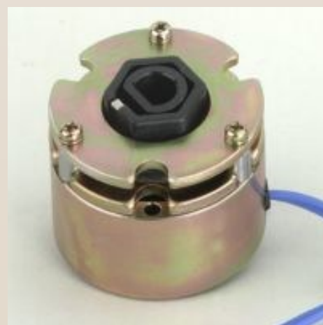
Ogura MCNB brake

Besides curtains, Ogura micro clutches are also used in door closers, door locks, rolling shutter doors and gates to help open, close or hold in place. ●