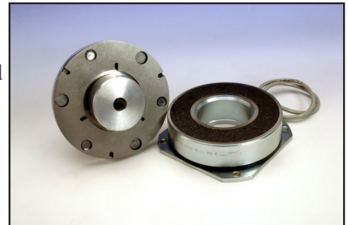
Permanent magnet (PMB) series

a new animation showing how permanent magnet brakes work. The animation shows an exploded