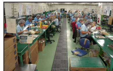
Busy workers in the plant

To keep employees informed, ISO performance meetings are held every month. This provides an opportunity to report achievements as well as to discuss any issues. In February, an ISO9001:2015 periodic inspection was conducted and only two comments were made at the end. The next task is to receive IATF certification for new business opportunities. ●