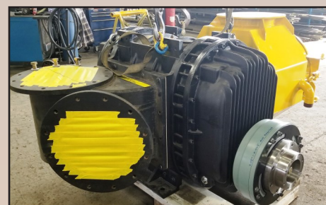
Ogura MMC-200 on vacuum pump