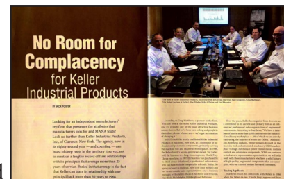
Article in MANA Agency Sales Magazine

K eller Industrial has been representing Ogura products for 38 years. In the June article of MANA Agency Sales magazine, they share the steps they take to maintain their top notch approach to supporting their customers and suppliers.●