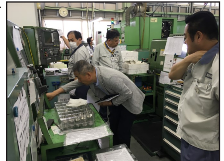
LRQA inspector conducts periodic audit

The inspectors pointed out some minor non-conformities to ISO9001 and to IATF16949, but the plants were also recognized for continual improvements and were rated highly for achieving the goals of “appropriately implementing management review, internal audit and development monitoring, and improvements for each department.” ●