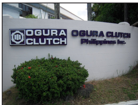
Ogura Clutch Philippines

Coil supply to the Ogura Group started in 1998 for automobile air conditioning clutches. This has provided a stable production base since that time. Since the purchase, Ogura has continued to put money and personnel in to the plant and the new business coming in is expanding the plant at a rapid pace.