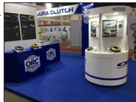
Ogura booth at Bangkok Auto Salon

Also, there were installed monitors on the front and back of the booth where videos explained the description of the clutches and Ogura's participation in motor sports.●