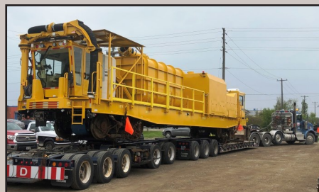
Vacuum excavator being delivered

transfer torque as required. Secondly, it is maintenance free. There are no worries about pressure loss fluctuations, leaks, or contaminants in the lines. The Ogura MMC Series clutch hits every check box for Arva's focus on solutions-based design, high reliability, maintenance efficiency, and reduced downtime. ●