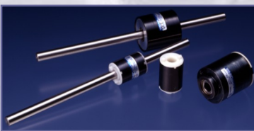
Ogura OPL clutches

To prevent double feeds, or having two sheets of paper run through the scanner simultaneously, the Falcon uses two OPL slip clutches from Ogura. The rollers that pull the paper through have the main drive roller and an opposing rubber roller running in the opposite direction. The OPL is mounted in the second rubber roller. For single sheets fed into the scanner, the main roller simply pulls it through. However, when scanning stacks of paper, the friction of the rubber roller is greater than the friction between the top two sheets of paper, resulting in a separation of the pages. The second sheet is held by the OPL until the first page has passed by and is scanned.