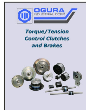
New Ogura product flyers