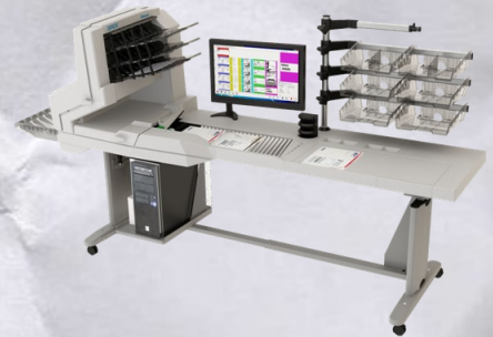
The Falcon™ scanner

Falcon can scan almost any document regardless of size, condition, or thickness: from business cards and manilla folders to onion skin paper and overnight envelopes. Since Falcon allows the operator to combine document prep and scanning in one step, it reduces the overall cost of the entire scanning process. Many labor components are eliminated by the unique capabilities of Falcon's four versatile feeder options. Falcon scans up to 220 images per minute at 300 dpi.