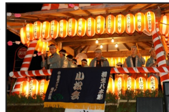
Yagibushi band in the Ogura float/tower

Although the weather was very warm this year, the festival was not interrupted by thunderstorms like it was last year. Many different events were held during the festival such as the kids' parade, textile marketplace, dance competition and the giant ball rolling competition. Many people got into the spirit dressing in the traditional summer attire called Yukata. As they had in the past few years, Ogura invited Maiko and Geisha women from Kyoto to be the guests on its float. This year, there was the new element of a singing contest added. The