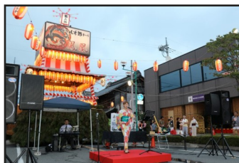
Inaugural singing competition