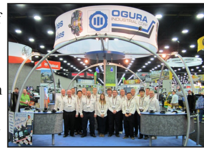
Participating 2015 booth staff

I n October, Ogura participated in the GIE Outdoor Power Equipment Expo held in Louisville, KY. Present at the Ogura booth were some OIC support personnel, product engineering and sales representatives. The show was an excellent way to get an introduction to the overall outdoor power equipment market. Once again, all of the large producers of outdoor power equipment exhibited at the show. This year's show set a new record in attendance. Show attendance was up on all three days with Thursday being by far, the busiest day.