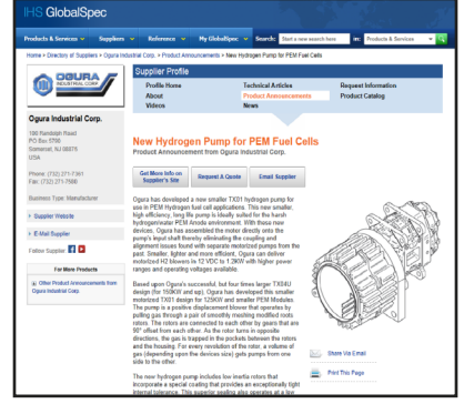
Global Spec Newsletter

from GlobalSpec, Ogura announced a new motor pump for moving wet hydrogen in a fuel cell application. The new motor pump also can be supplied with an optional controller. This smaller, lighter and more efficient pump can