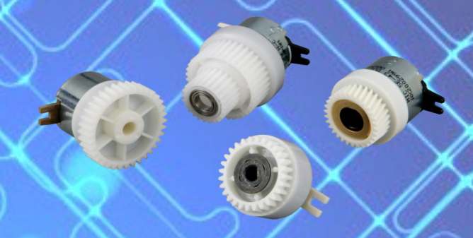
MIC Micro Clutches

In the manual mode, the clutch is disengaged, so a user can simply turn the knob to lock or unlock the door. In the automatic mode, a motor drives a small reducer going into the clutch, and in turn, the clutch drives the gearhead to either a locked or unlocked condition.