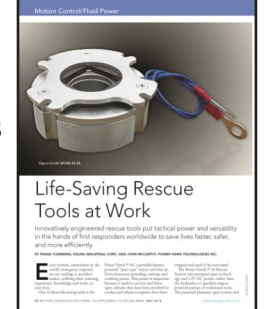
Article in Design News

he May issue of Design News featured an article showing how Ogura brakes are used in the PowerHawk lifesaving rescue tools. The article explained how the rescue tools are used in environmentally challenging conditions for mechanical products and how modifications to the Ogura brake help the tools to function in these challenging environmental situations. The article also showed he