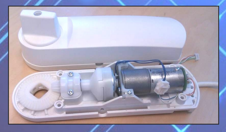
Clutch Gearbox and Motor

The new motor lock is installed in private homes of care-dependent people. This helps the caregivers by providing convenient and safe access to the outpatient care homes at any time, especially in case of a medical emergency.