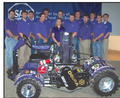
Winning KSU design with Ogura clutches

The president of the Kansas State tractor team said, "without your help and your clutches, we would not have been able to have the simple and smooth engagement of our drive train. Many schools have a transmission and are always grinding gears to pop their tractor into gear. Our power shift had people talking." ●