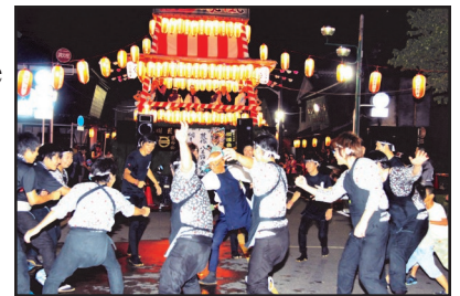
Annual Yagibushi festival