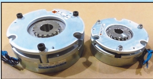
Ogura models RNB and SNB

SNB-1.2K, has a static torque rating of around 9 ft. lb. The brake is mounted on the input shaft, (opposite side) of the worm gear reducer. The SNB brake is designed for both stopping and holding. When no current/voltage is applied to the brake, a series of springs push against an internal pressure plate squeezing the friction disc between the inner pressure plate and the outer cover place. This frictional clamping force is transferred to the hub which is mounted to the shaft of the reducer.