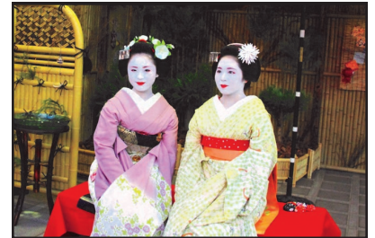
Maiko girls at the festival

It is rumored that some tailgating may have occurred prior to and after the parade, but that has not been confirmed. ●