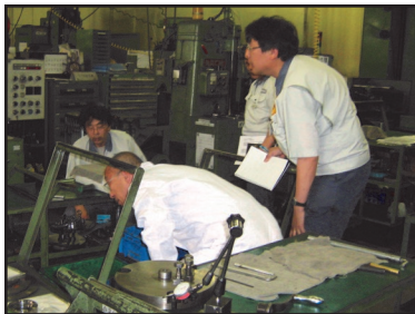
Lloyd's auditor reviews parts machining