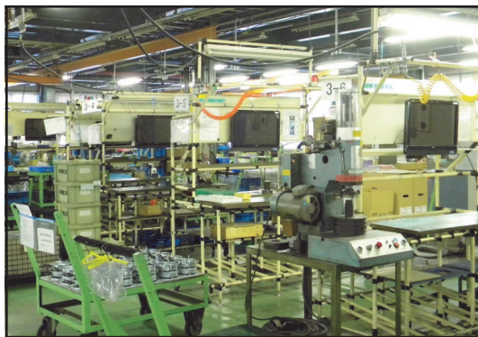
New touchscreen workstations

Before this improvement, the operator had to find the relevant drawing that was stored in one of 300 binders. The old process was that the worker had to remove the drawing from the binder, make a copy, return the binder to the shelf and then take the drawing back to the workstation. This process took about three minutes and in some instances, where drawings had been taken out multiple times, they were becoming dirty, or in some cases, ripped.