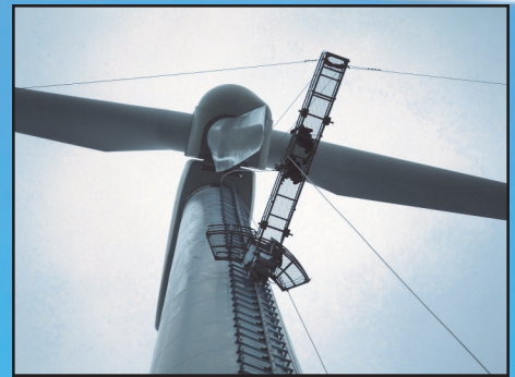
Bottom view of elevator with inspection basket lowered

engaged as an additional service brake. The RNB-10K is attached to the output of the gearbox and is located next to the pinion gear. This RNB brake was designed in case of a