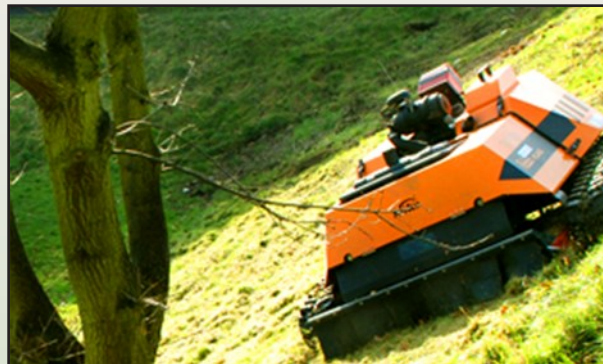
Roboflail cutting a steep grade