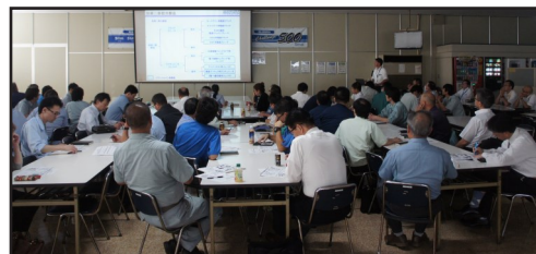
Quality Control Seminar

The questionnaire given after the workshop showed that the participants were satisfied with the training course and Ogura could see what topics they wanted to discuss in the next workshop. The time spent was meaningful not only for the suppliers but for Ogura as well. The Quality Assurance Committee will continue to offer this seminar to improve the business partners’ quality control abilities. ●