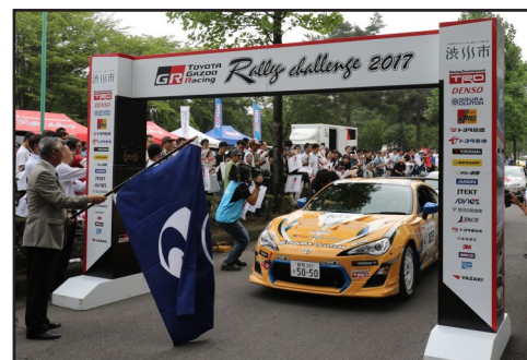
Ogura sponsored car at start line

Ogura drivers also took part in the special competition round, where only Eastern and Western series winners are invited. Ogura took 4 th place in E-2 class and 2 nd place in E-4 class. •