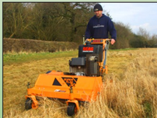
STM's Super Flail heads designed for use on the SCAG SWZ

In a closed loop system, such as one with an e-governor or steady RPM where feedback is unimportant, the SoftStart controller can still be used. The controller follows a predetermined ramp time providing a smoother engagement.