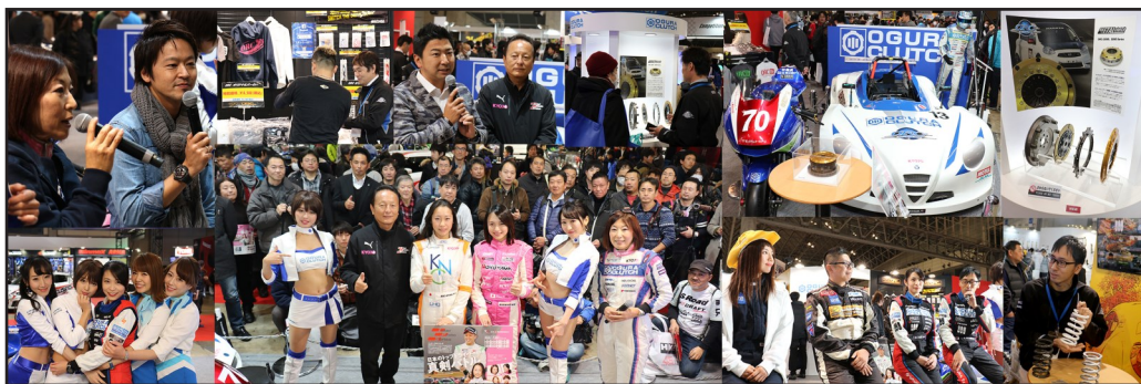
Images from the 2018 Tokyo Auto Salon

This year, Ogura will be promoting its reinforced racing clutch at top races like the "Super GT", and various Drifting races. ●