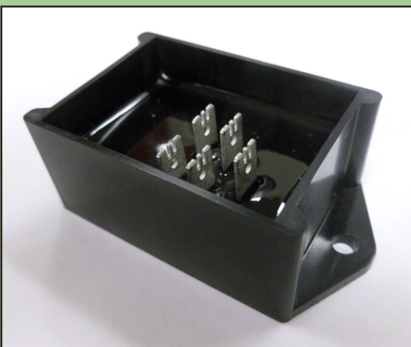
Ogura's SoftStart controller

SCAG ride on units in the near future mainly to bring customers' costs down. Mainly to prolong their belt life."