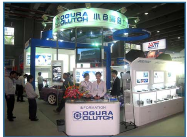
Ogura China Show

A t the China International Exhibition for Automotive Air Conditioning and Transport Refrigeration last month, Ogura showed its extensive product line for the Chinese market. The Ogura manufacturing facility in Dong Guan has continued to expand and has doubled its workforce in a short amount of time. The factory makes a wide range of air conditioning and other mobile-related products. These were on display at the show. The show tracked a wide range of domestic and overseas manufacturers and was an excellent opportunity for Ogura to display its wide range of products. ●