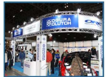
Ogura Booth at 2011 Tokyo Auto Show

The theme for this year's show was to produce fun while driving. The new products for the Japanese domestic market included the new metal clutch series and the light clutch series of engine clutches. ●