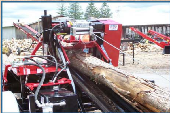
Winch pulling log into cut off

Located in the hamlet of Barneveld, in up-state New York, Hud-Son manufactures, distributes and sells a variety of forestry equipment, including custom and portable saw mills, band saws, splitters, winches, and other items. The newest and hottest product in this line is "The Badger," an all-in-one firewood processor. The Badger is a boon to both homeowners and firewood suppliers alike. It skids, saws, and splits over a cord of wood in one hour – that's typically more than 3500 pounds of hardwood that no longer needs to be processed by hand.