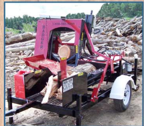
Hud-son Badger portable firewood processor

They are available in 1" and 1 1/8" bore sizes and feature a large number of output pulley sizes and styles. To learn more about the GT2.5 and the entire line of PTO clutch/brakes as well as Ogura's Off-highway, Mobile, and Industrial clutches and brakes, please visit our website at www.ogura-clutch.com .