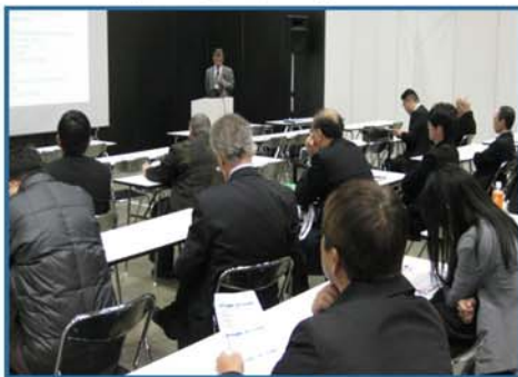
Ogura's Technical Seminar